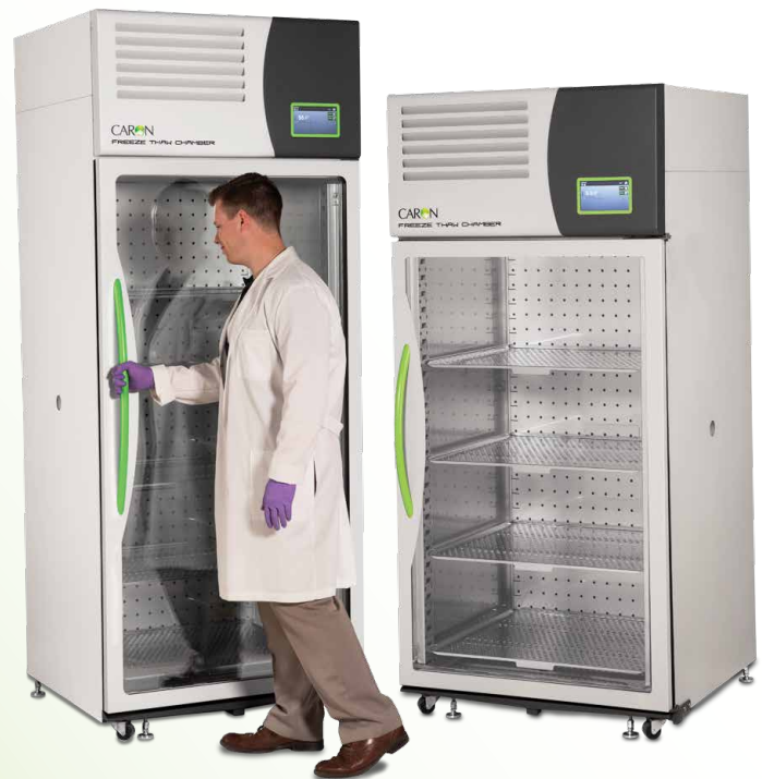
33 ft 3 Large capacity, small footprint

Common applications for these chambers include: freeze/thaw studies, pharmaceutical drug studies, concrete and asphalt testing, coating and adhesive testing, outdoor weathering tests, stress testing and more! Not only are these Freeze/Thaw Chambers consistently reliable, but they also offer energy